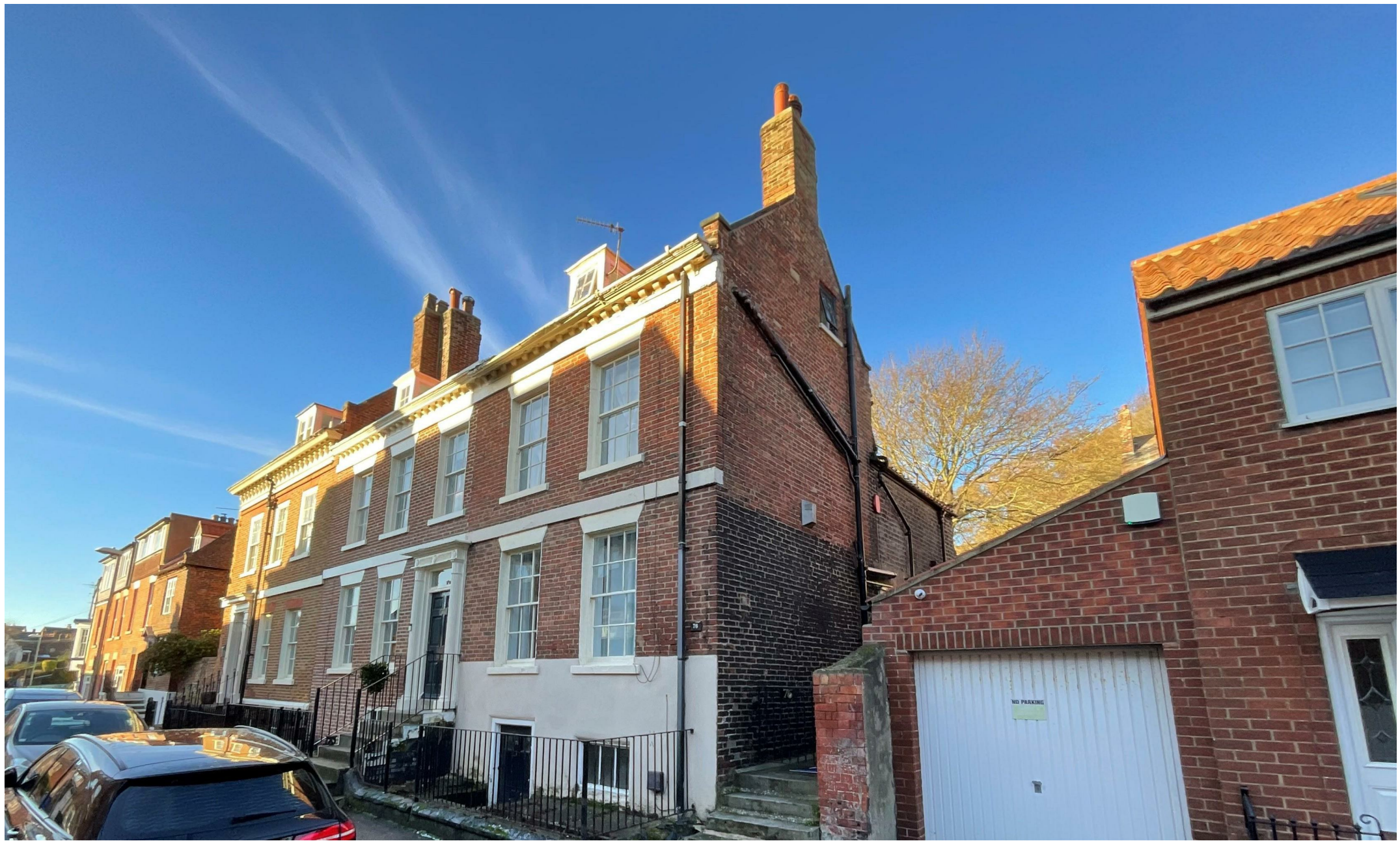
76 Longwestgate, Scarborough YO11 1RG Auction Guide £120,000